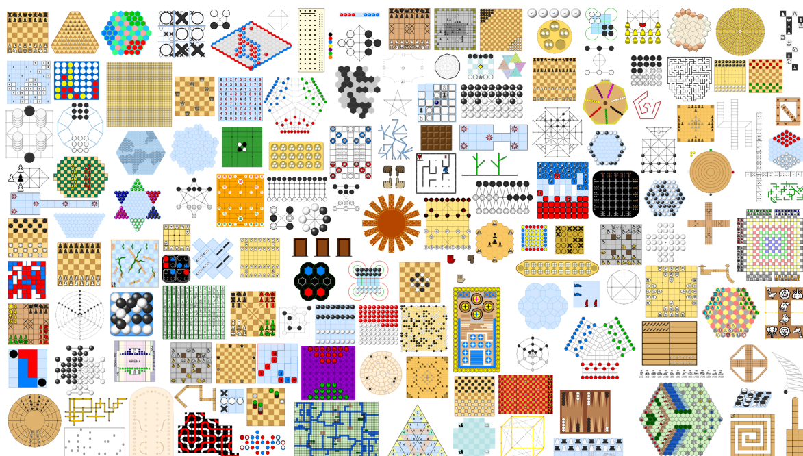
Fig. 1. Overview of a subset of Ludii games.

The UCT baseline used 0.5s of thinking time per move during this smart minute, and then played randomly. This allows a full Kilothon to be run in approximately 17 hours.